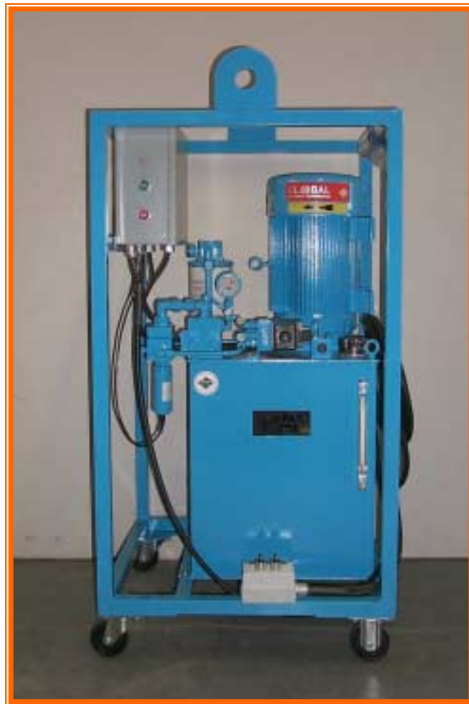
GMT1030 SINGLE FLOW POWER PACK